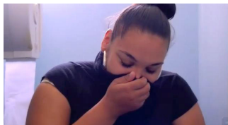
Medium Close up

www.boldfaceproductions.co.uk www.twitter.com/boldfacepro www.youtube.com/boldfacepro Facebook group: boldface productions