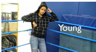
Medium Long Shot

Full shot of person is seen but also of surroundings, can be used to showcase loneliness or isolation