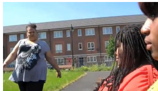
2 shot, 3 Shot

Head and shoulders seen in shot, like a close up but more is seen of the body