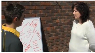
Over The Shoulder

Camera points down from above eye line, used to showcase vulnerability