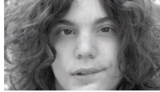
Big Close up

Camera shown from over a person's shoulder, used to showcase another dimension to the scene